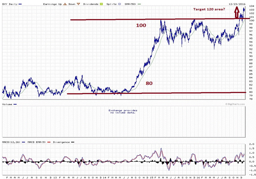
USD is having a textbook breakout

Gold has been having a roller coaster ride in 2016. I had a prediction last year that I saw gold to be likely bottom in 2017, I could still be right. The reason behind this is that USD in bull market usually rises for at least 6 years. The 6 th year is 2018. If USD top out around 2018, then it is reasonable to predict gold to bottom around 2017, a year earlier. However, the main risk is that USD rises longer than the previous bull market.